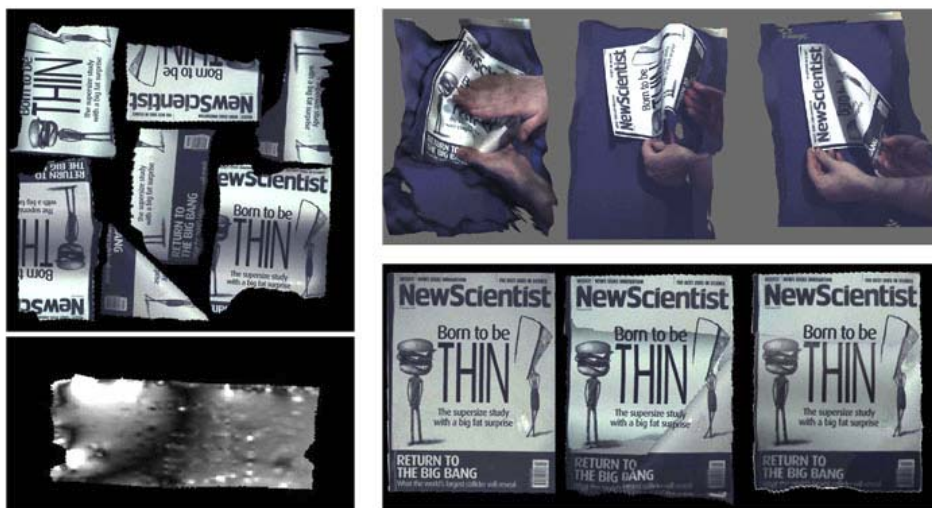
Figure 2: Deformable surface reconstruction from multiple range observations. TL: Regions matched and extracted from several range images (some of which are shown in TR). BL the resulting reconstruction comparing (left) the true surface texture, (middle) rigidly aligned patches and (right) the nonrigidly aligned and stitched model. BL: An example distortion map for a particular segment.